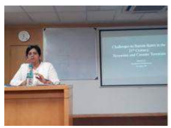
Savita Hande I.P.S, and currently Chief Security Advisor-United Nations (Afghanistan) delivering lecture on Terrorism and Counter Terrorism

• Celebration of Indian Constitution Day: The students participated in reading out the preamble to the Indian Constitution and the fundamental duties. The Students were shown 'Samvidhan' series to throw light on the working of the Constituent Assembly. The Department of Political Science collaborated with Centre for Development Studies and Activities (CDSA), Pune by joining the Alliance for Resilient Cities. CDSA Conducted training of more than 125 Political Science students of FYBA and SYBA, who carried out a survey using INagrik App in December 2019 and January 2020. This project was carried out to survey urban resilience and has the support of UNICEF for QCM(Quantified Cities Movement)- DRR( Disaster Risk Reduction) project. The project aimed to create a reporting system for young citizens, empowering them to suggest innovative solutions which were shared with the Government and UNICEF (Delhi).