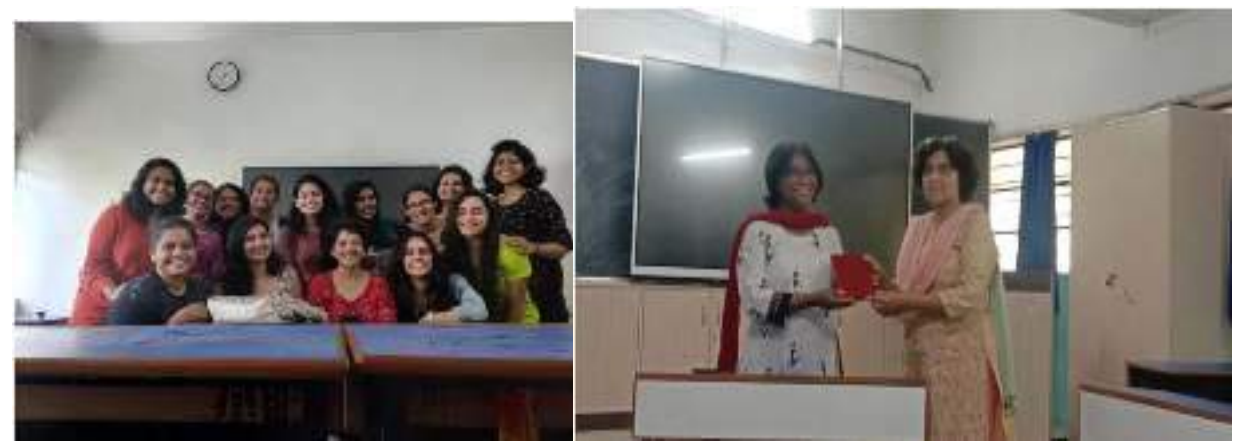
Guest Lecture Regarding Counseling