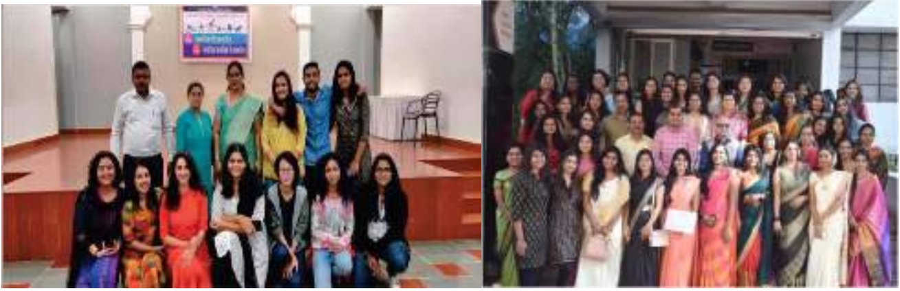
Cultural Activities conducted by Interns in Kamayani for their students