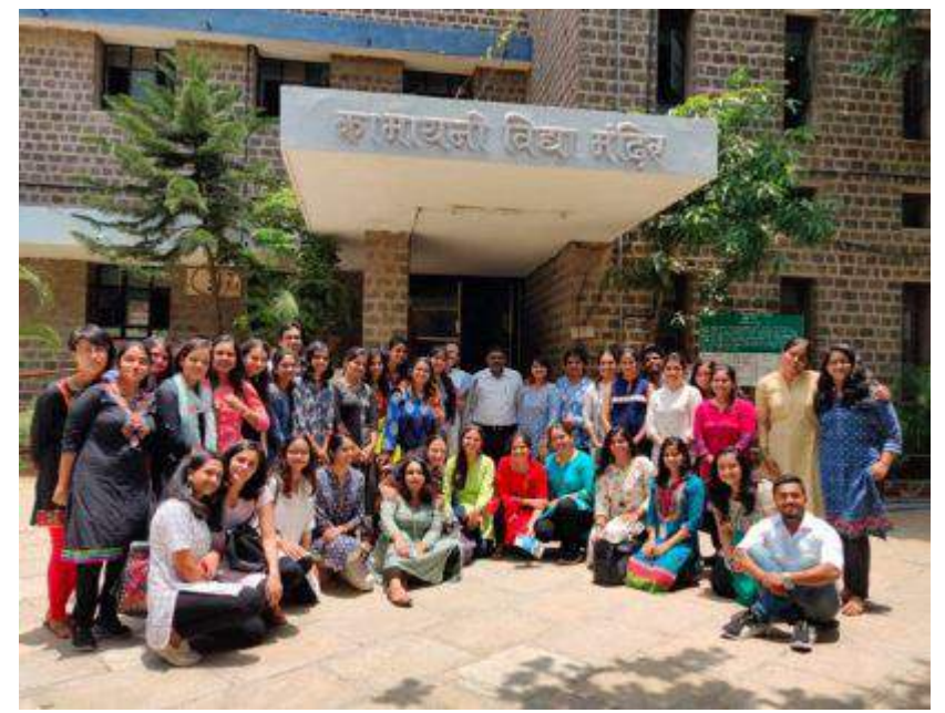
STUDENTS VISITED THE KAMAYANI SCHOOL FOR SPECIAL CHILDREN, THE STUDENTS INTERACTED AND INDULGED IN ACTIVITIES WITH THE SPECIAL CHILDREN.

• The Department of Psychology was part of the Rally organized by Kamayani- School for Special Children. The purpose of the Rally was to create awareness regarding Divyang (Part of Divyang Saptah)